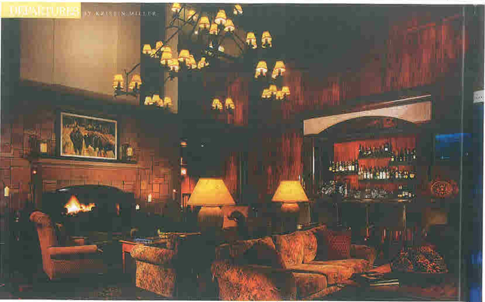
Vail Cascade's Fireside Bar is inviting for après ski cocktails and relaxation.