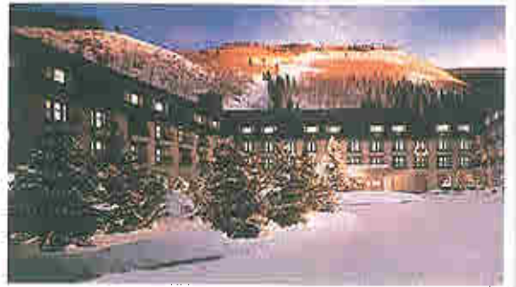
Vail Cascade Resort & Spa

Consistently applauded as one of the top ski resort destinations in North America in an annual poll conducted by SKI magazine , Vail, Colorado is also world-renowned for its outstanding shopping, out-of-this-world dining venues, remarkable accommodations and spas; celebrity-studded year-round festivals and quite certainly it's endless opportunity for outdoor adventure. More recently the already glitzy resort town has been un-